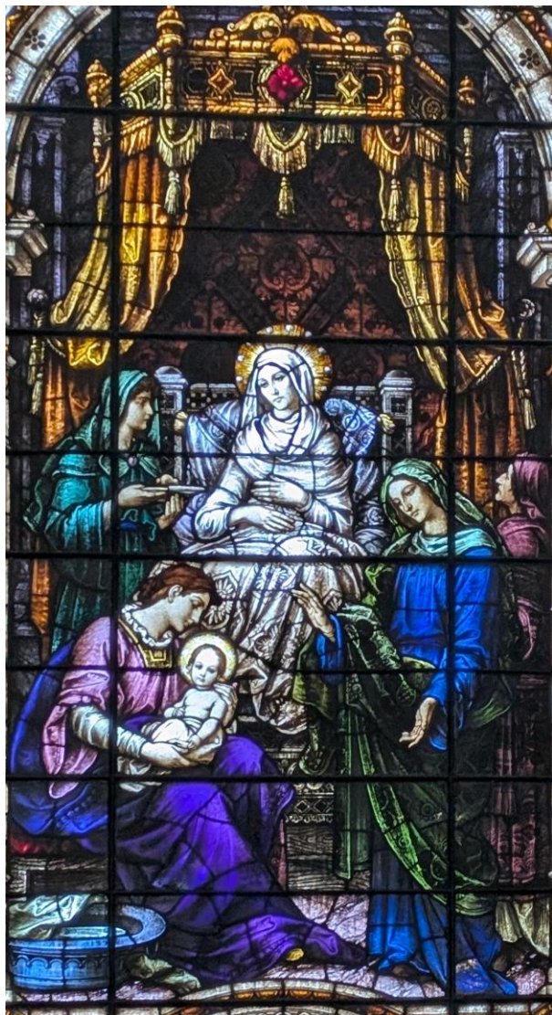
Birth of Mary