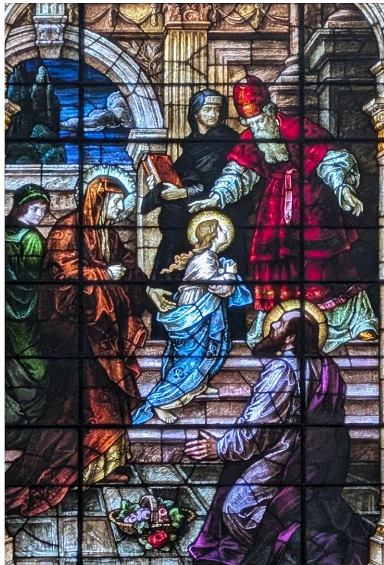
Mary Presented at Temple